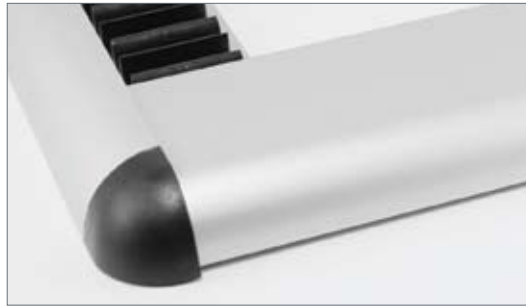
Directory using Slatz Curved Edge finishing plate