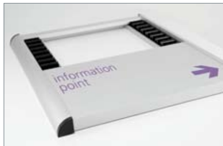
"Top and tail" any Slatz directory