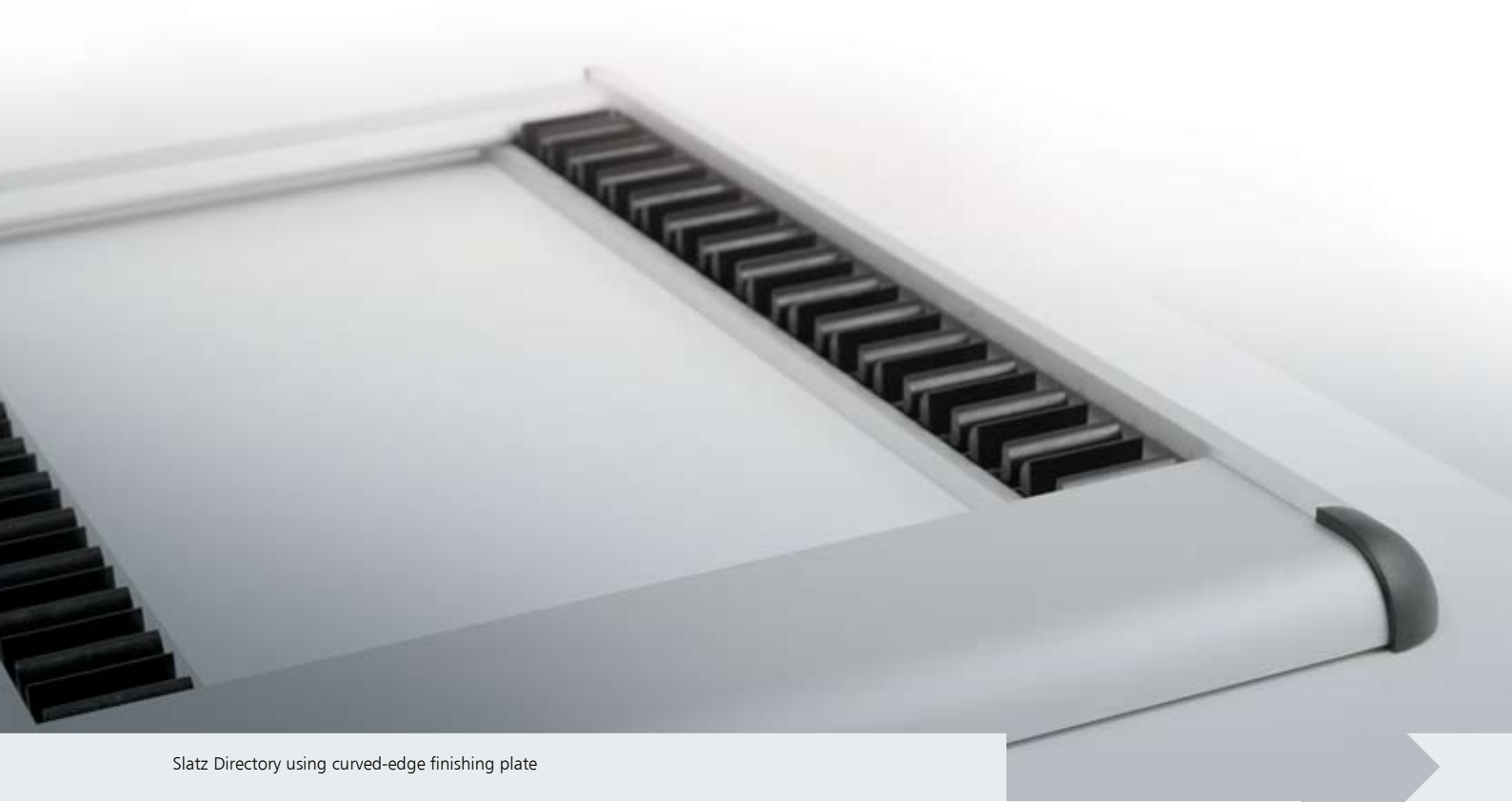
Slatz Directory using curved-edge finishing plate