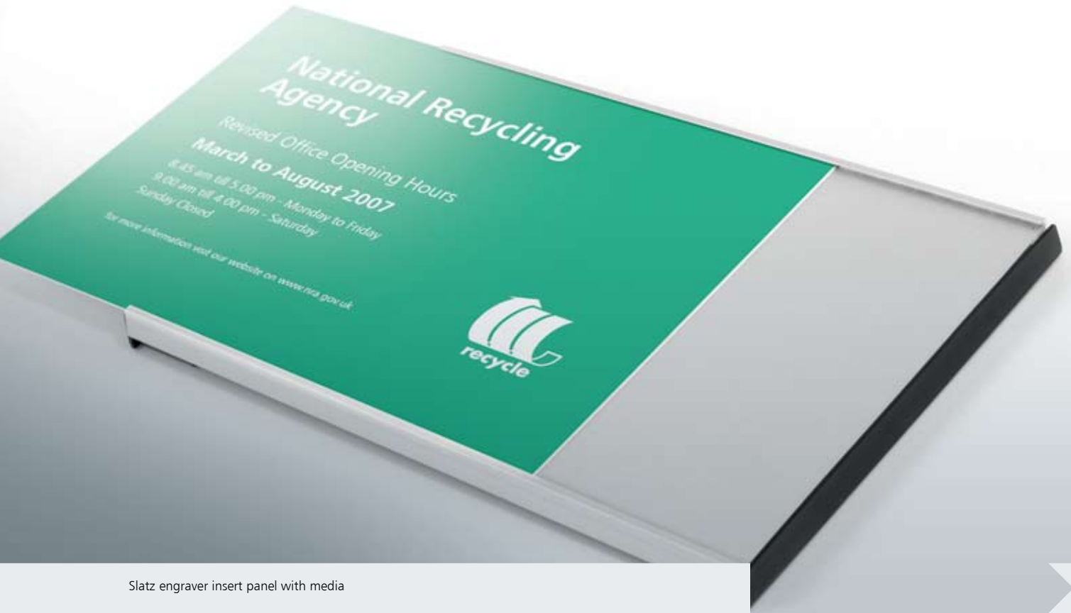
Slatz engraver insert panel with media