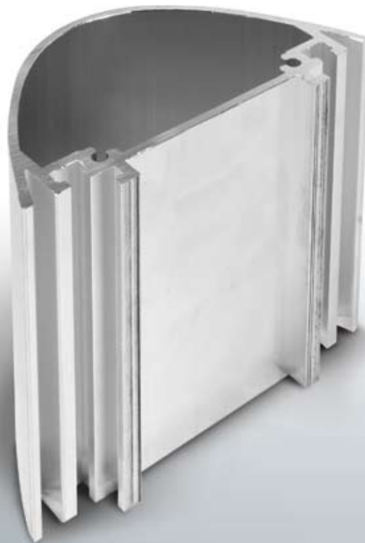
Signpole Navigator extrusion