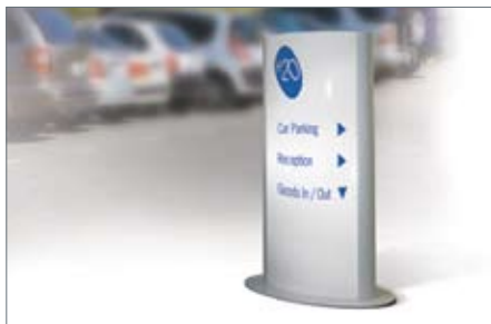
▲ Curved monolith sign with Signpole Navigator extrusion