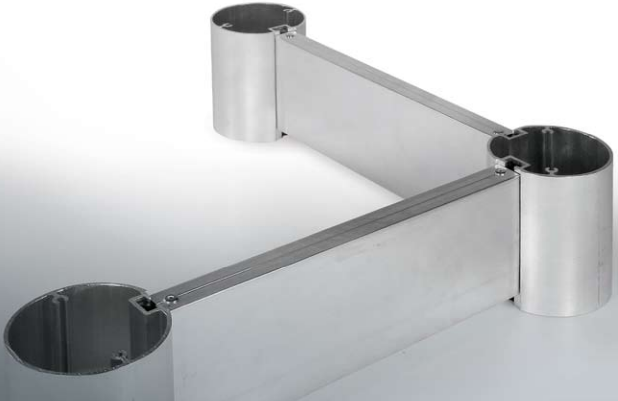
Signpole single slot and Signpole adjacent slot creating a 90° angle sign